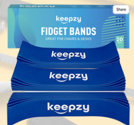
FIDGET BANDS FOR CHAIRS